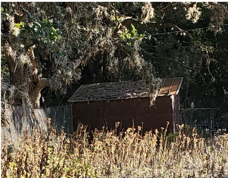
Figure 8 - Accessory Structure 04