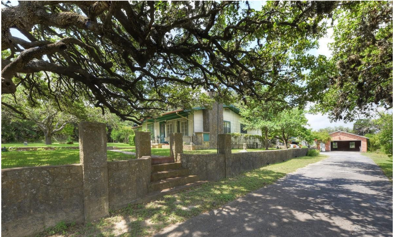
Figure 3 - Main Building