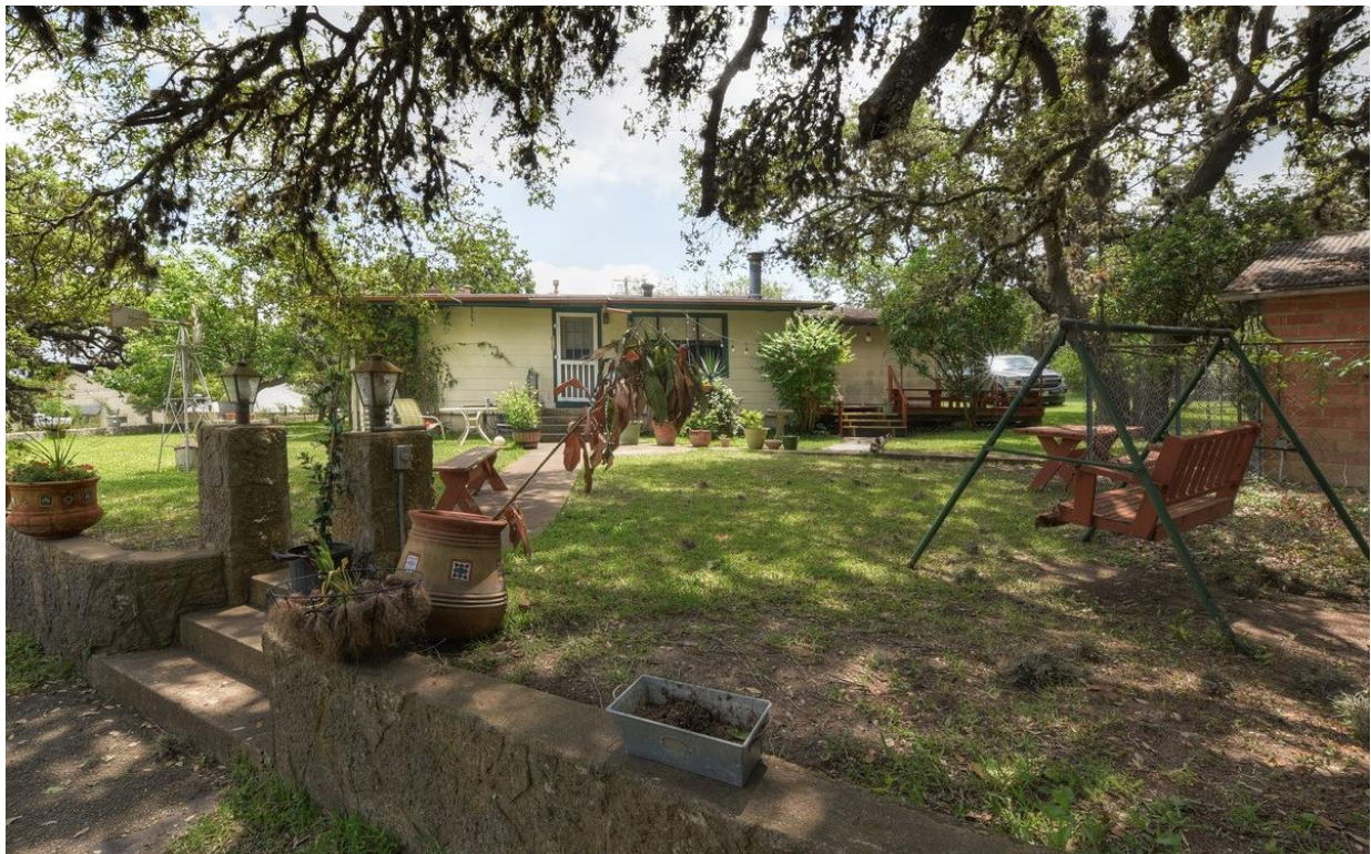
Figure 4 - Main Building