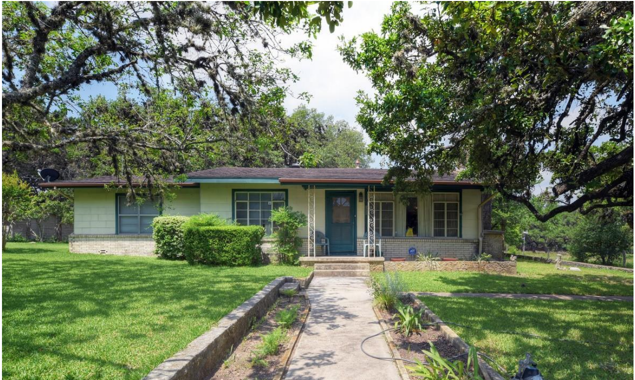
Figure 1- Main Building