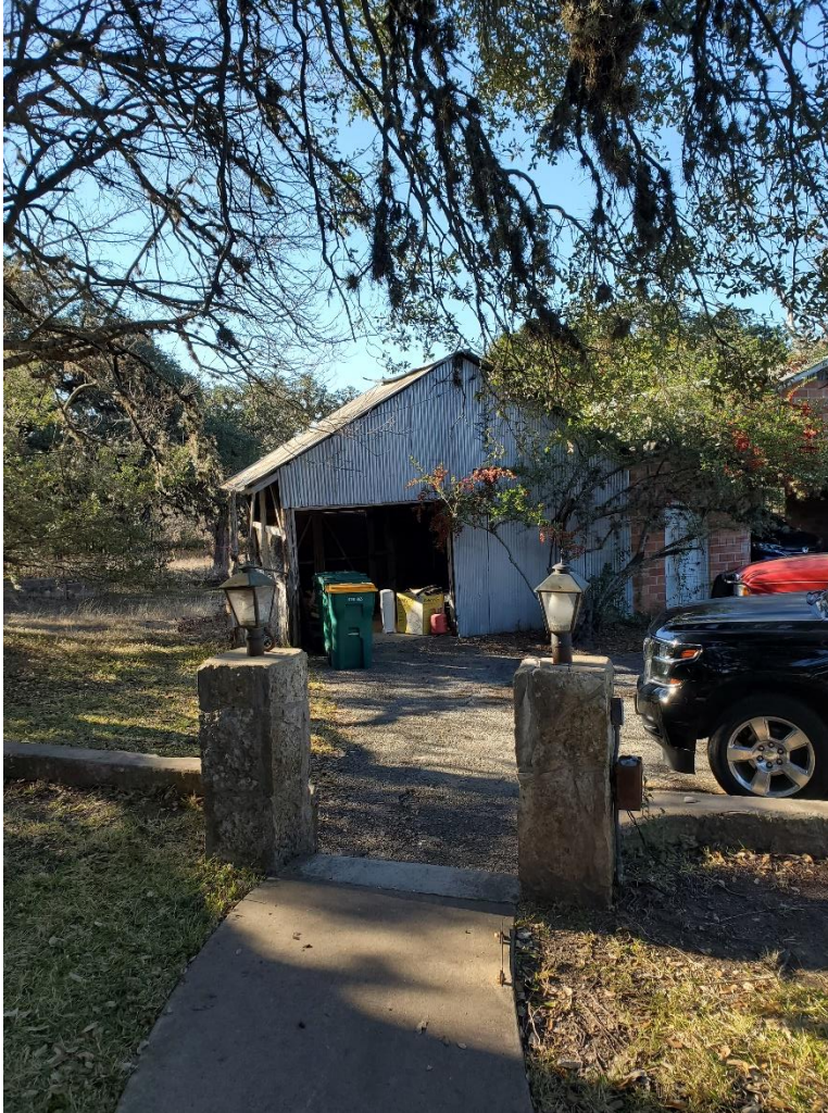
Figure 7 - Accessory Structure 03