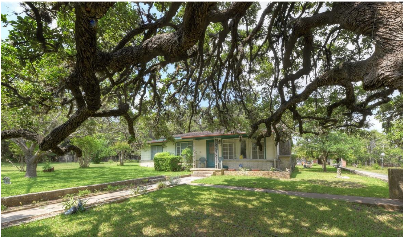
Figure 2 - Main Building