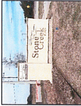
Photo Survey - Existing FRONT VIEW