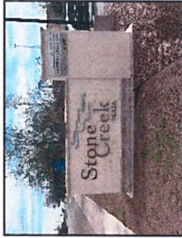
Photo Survey - Existing BACK VIEW