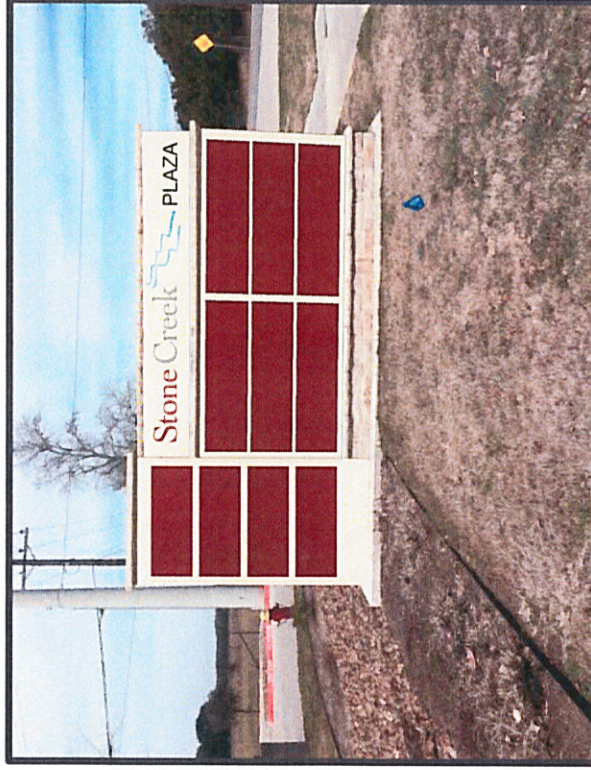
Photo Survey - Proposed - FRONT VIEW