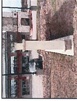
Photo Survey - Existing STREET VIEW