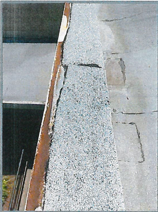
Parapet wall over the window with water damages. Visible fibers of roofing material. This is not storm related.