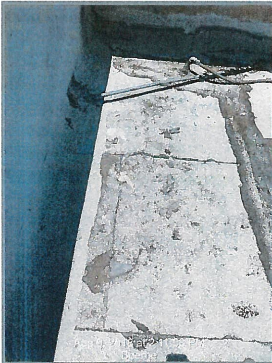
Overview of rear elevation near the HVAC unit.