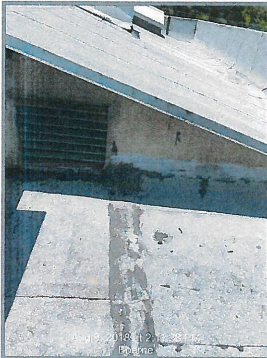
Rear elevation - tar patches along the building with roofing material.