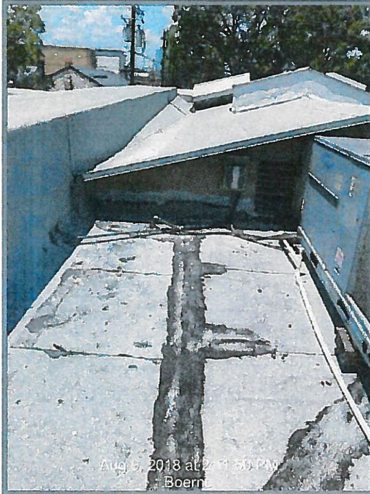
Rear elevation - several tar patches and abnormal wear to the roofing material.