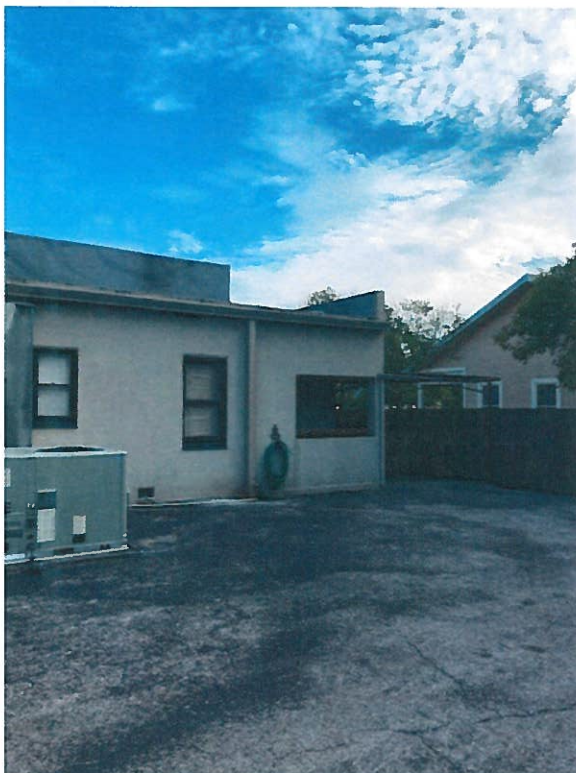
Gutter Replacement at rear of bldg.