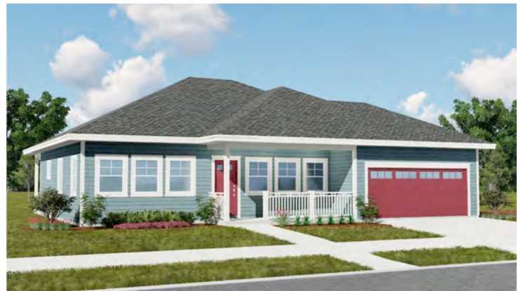
Front Image Elevation