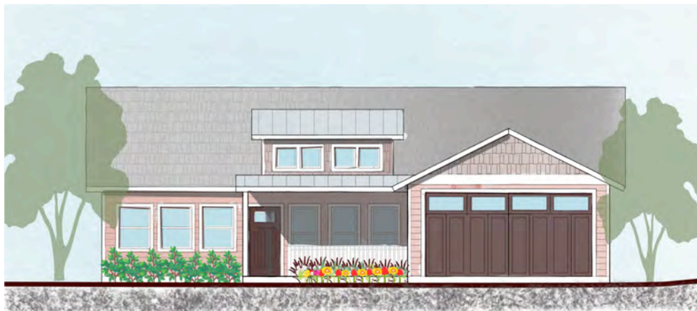
Front Image Elevation