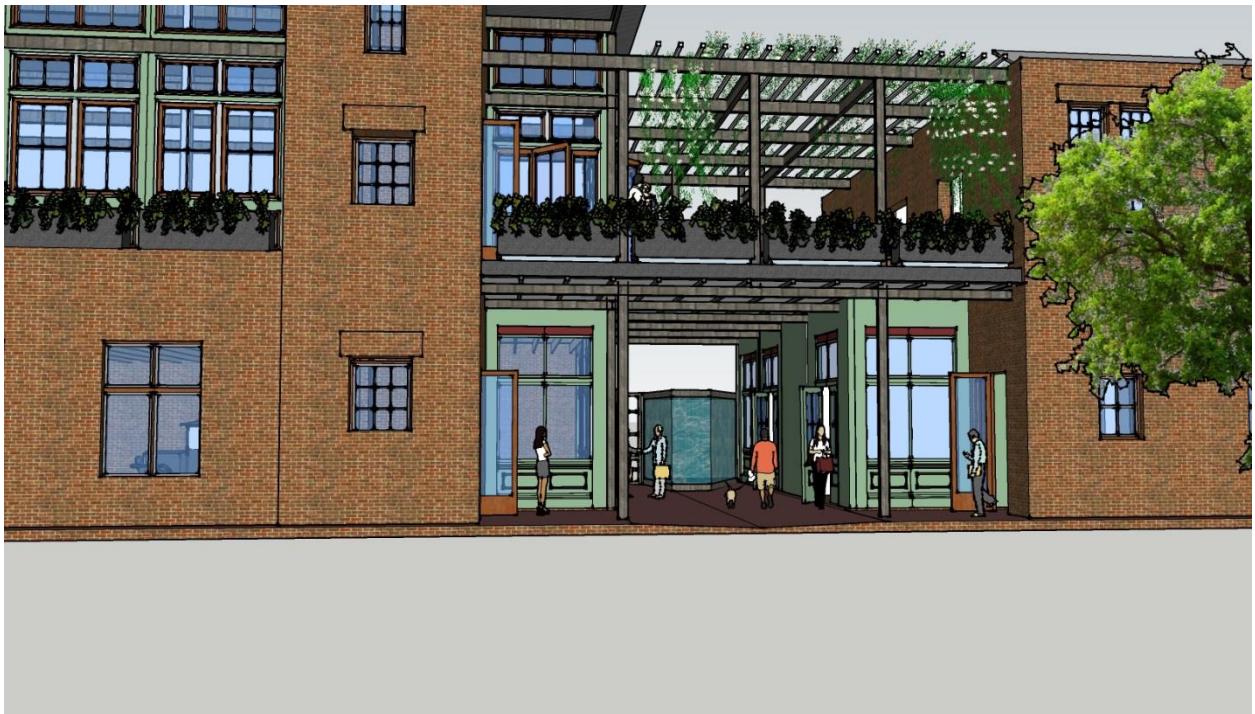
Proposed Breeze Way

Proposed Building Permit Building renovation and new construction