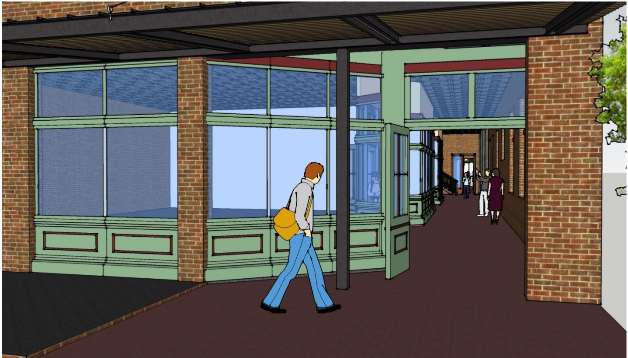
Proposed Entry 1