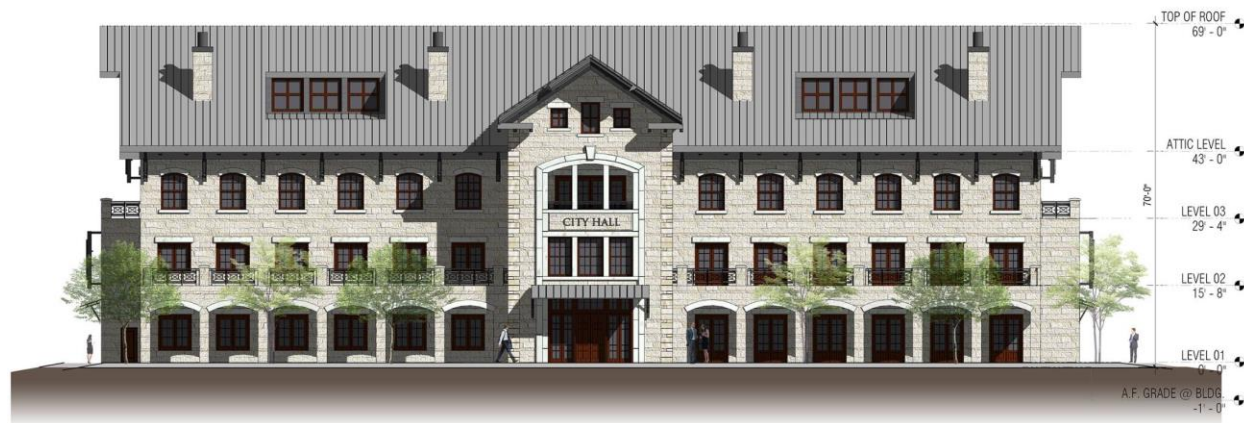
West – Optional Window Configuration (1 st & 2 nd Floors North End)