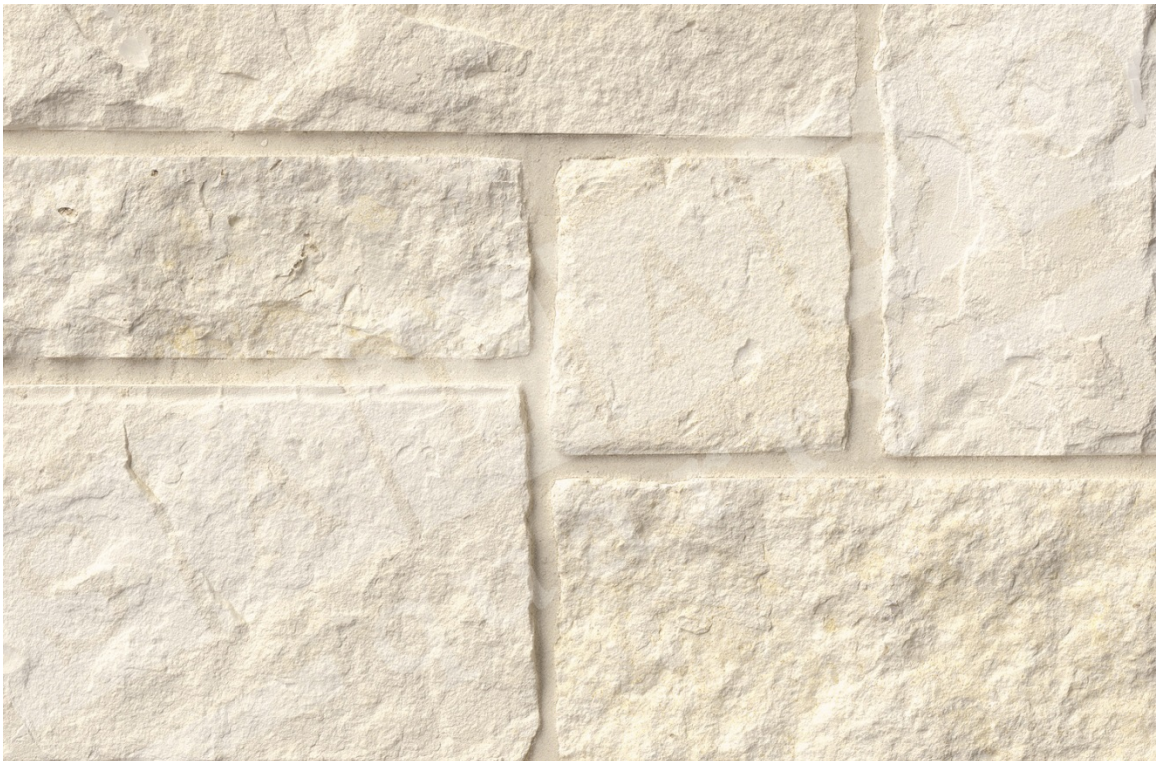
Stone Sample #2