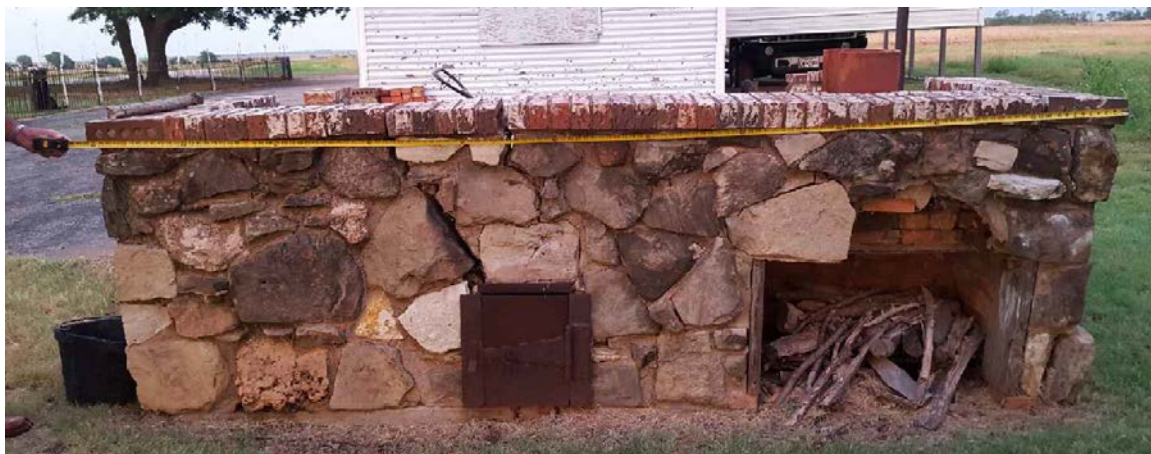
Back Elevation - Example