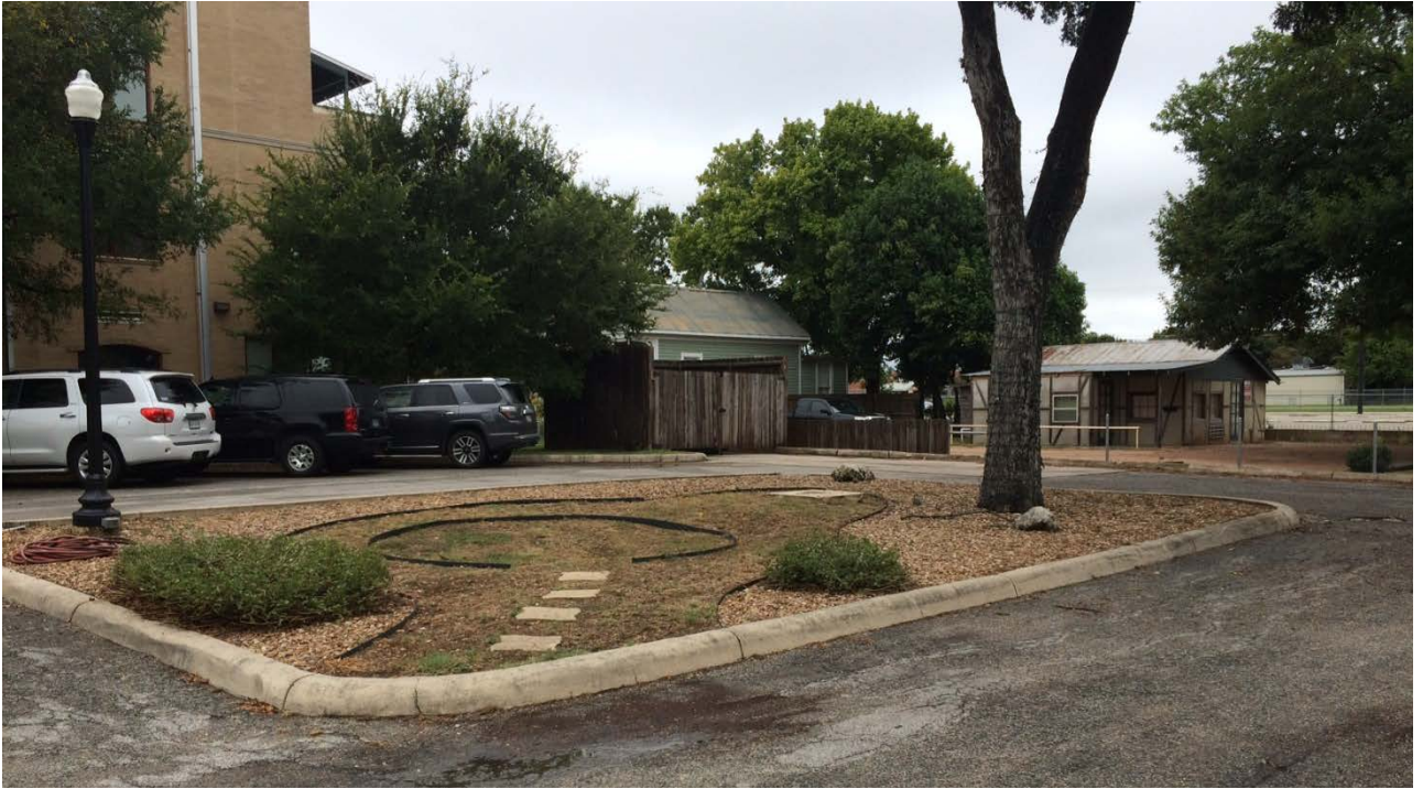
Proposed Location - Northwest View