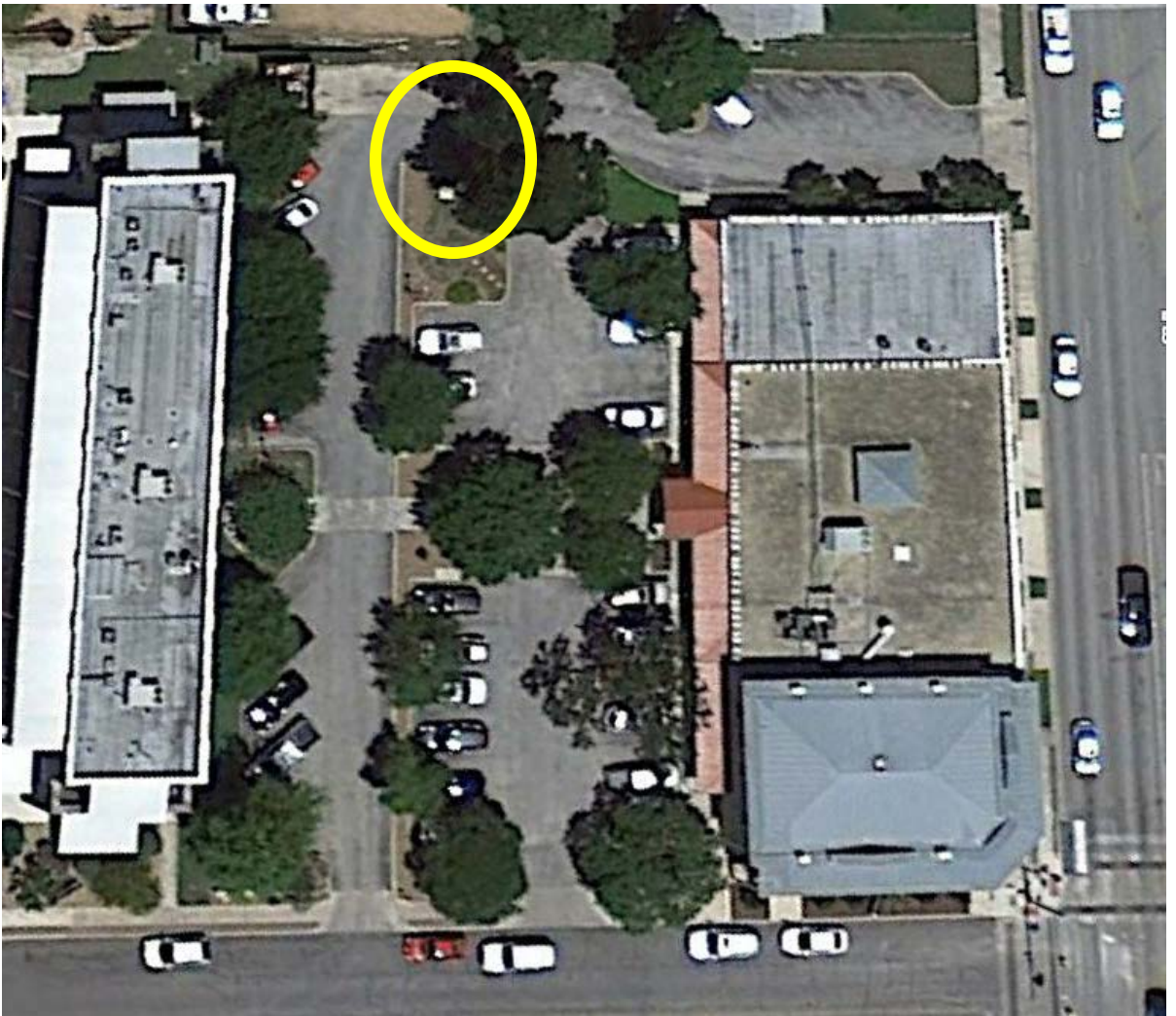
Proposed BBQ Pit Location (Parking Lot Island – Yellow Circle Area)