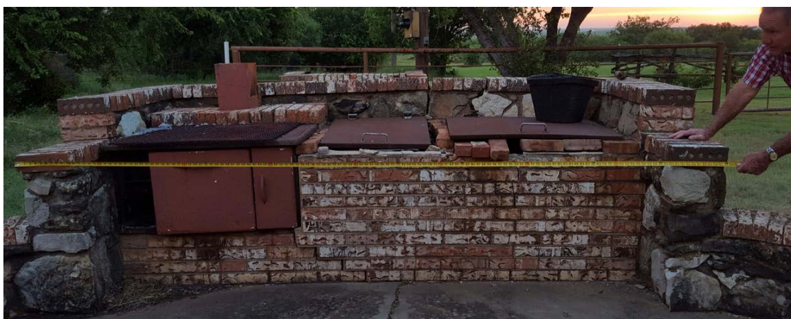
Front Elevation - Example