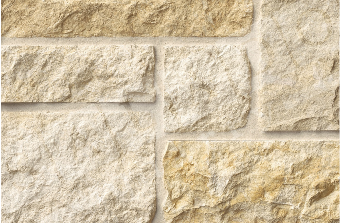
Stone Sample #1