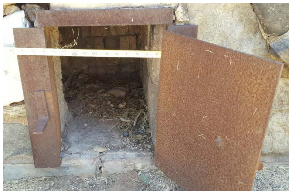
Pit Openings Examples