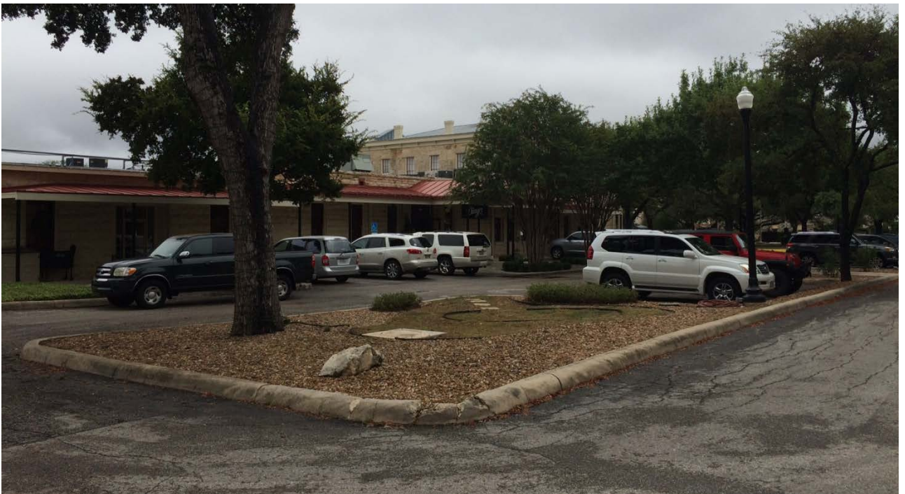
Proposed Location - Southeast View