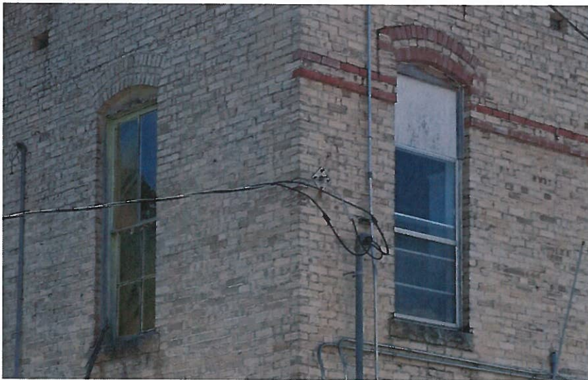
Windows to be replaced:

Please see below submission requesting permission to replace some of the windows on the property at 179 S. Main Street. I would like to replace the windows on the north side, above the parking lot. The windows are currently inexpensive aluminum windows that do not fill up the entire window opening, which has been covered with plywood. I would like to replace all of these windows (12) with new wood windows that match the original windows on the other sides of the building. See picture below showing the original window (left) and the window that will be replaced (right).