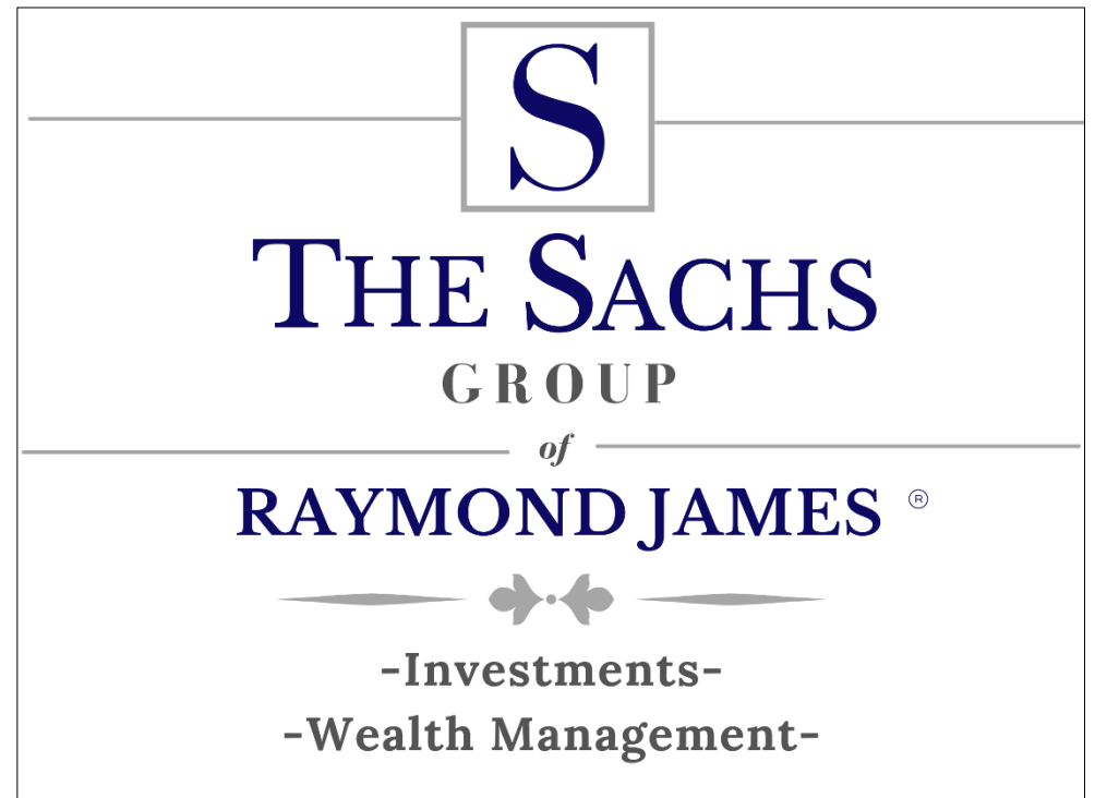
Proposed Sign Design