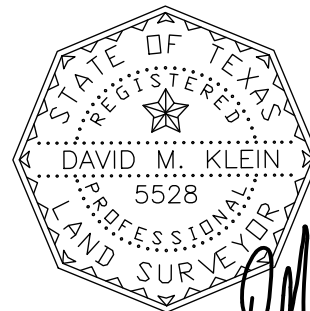
Exhibit showing a 1.633 acre tract of land out of the Antonio Lockmar Survey No. 178, Abstract No. 311, Kendall County, Texas, being a portion of Interstate Highway No. 10 right of way.