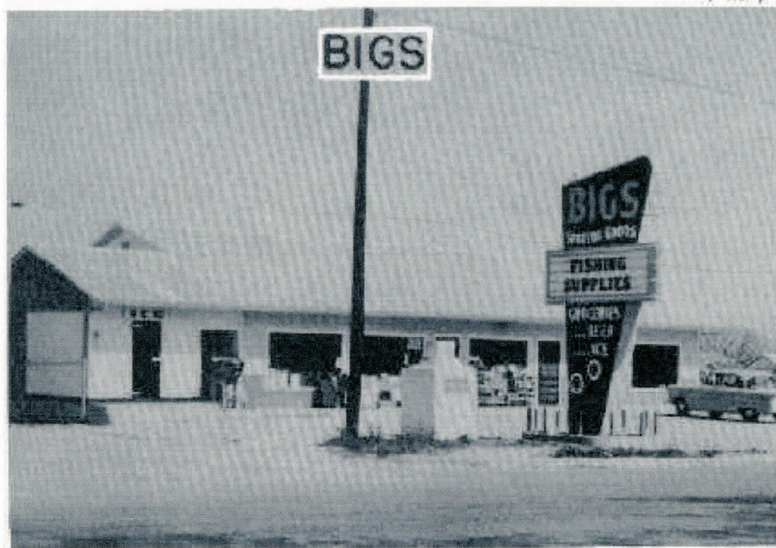
BIGS OF BOERNE 319 N. Main Library File #19.2